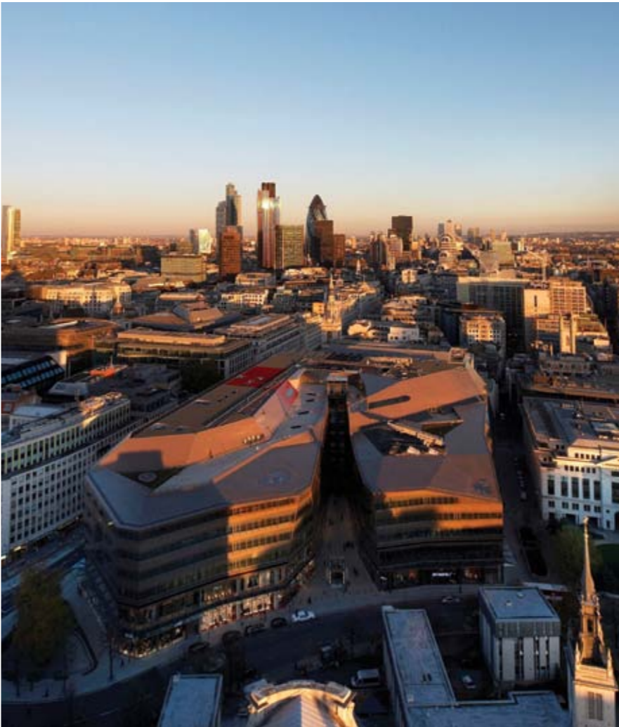
Retail / Office: One New Change, London; Powershield Fire Doors