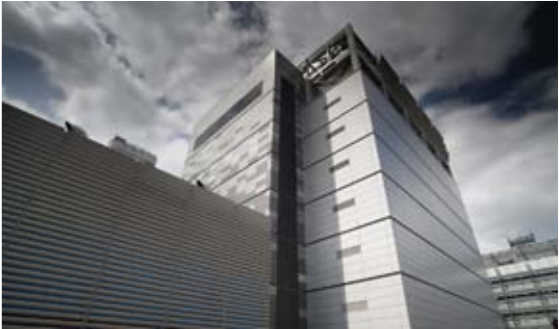
Commercial: Telehouse West, London; Powershield Fire and Safeguard Security Doors