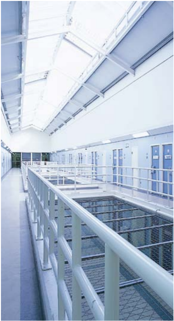
Custodial: Various UK & Ireland prisons; Powershield and Safeguard High Security Doors