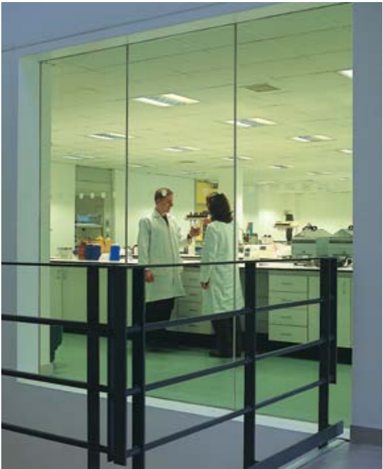
Pharma / Biotech: Queen's University Research Laboratory; Belfast; Powershield Cleanroom Doors